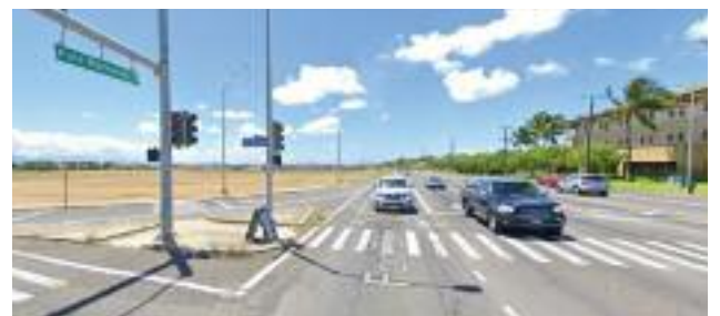
Fort Barrette Road improvements will run from Roosevelt Avenue to Farrington Highway.