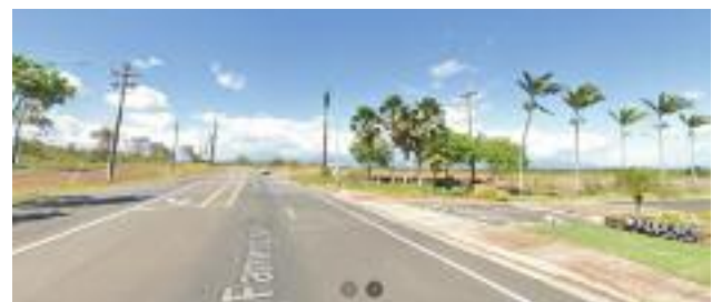
Image (Courtesy of Google Maps): Widening of Farrington Highway will run from Kapolei Golf Course to Fort Weaver Road.