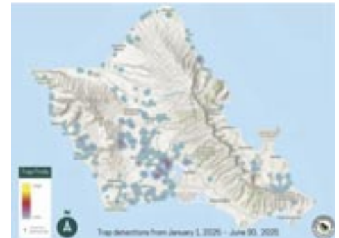
"Trap detections from January–June 2025. Red areas indicate higher CRB finds."