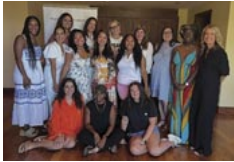
Future Caucus' 19th Collective in Tucson, Arizona program. This is exciting news and a meaningful step forward for our communities.

This past session, I introduced House Resolution 8 to call attention to the Missing and Murdered Indigenous Persons (MMIP) crisis and to request greater federal support for Hawai'i. The resolution passed the House and was transmitted to the U.S. Department of Justice. I am pleased to share that I recently received a letter from the U.S. Department of Justice confirming they will provide resources to assist our state in strengthening the MMIP